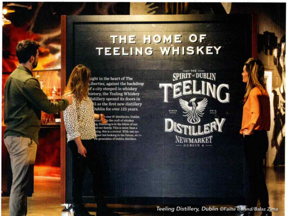
Teeling Distillery, Dublin